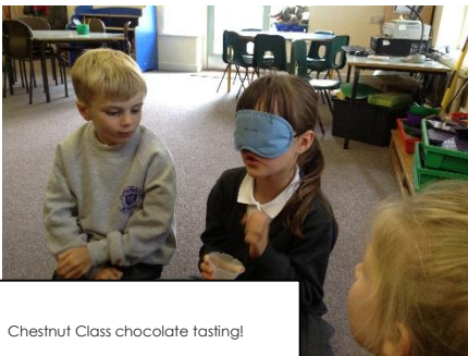
Chestnut Class chocolate tasting!

We would love to start up a 'Friends of the School' (PTA) here at Honington. Speak to the office or any member of staff if you are interested in becoming involved.