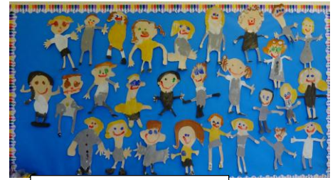
Rowan Class portraits

Can you guess who their Kenning poem is describing?