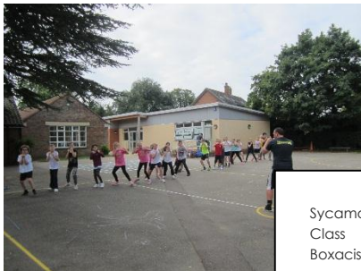
Sycamore Class Boxercise!