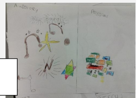
Birch Class looked at learning styles.