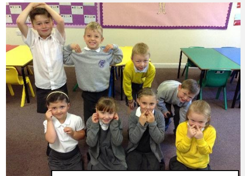
Oak Class: Heads, shoulders, knees and toes!

Please remember to send PE kits into school on the appropriate days for your child's class. Earrings MUST be removed for PE lessons.